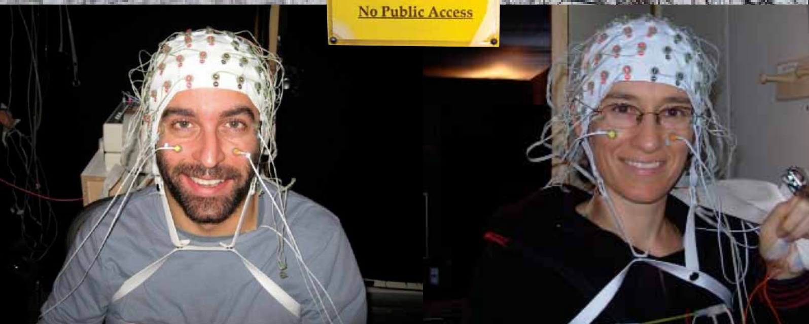
In the psycho-physiology research lab: three participants, hooked up to an EEG-machine; with 88 equidistant scalp-electrodes caps.

Shamatha Project Silent Practice Area No Public Access