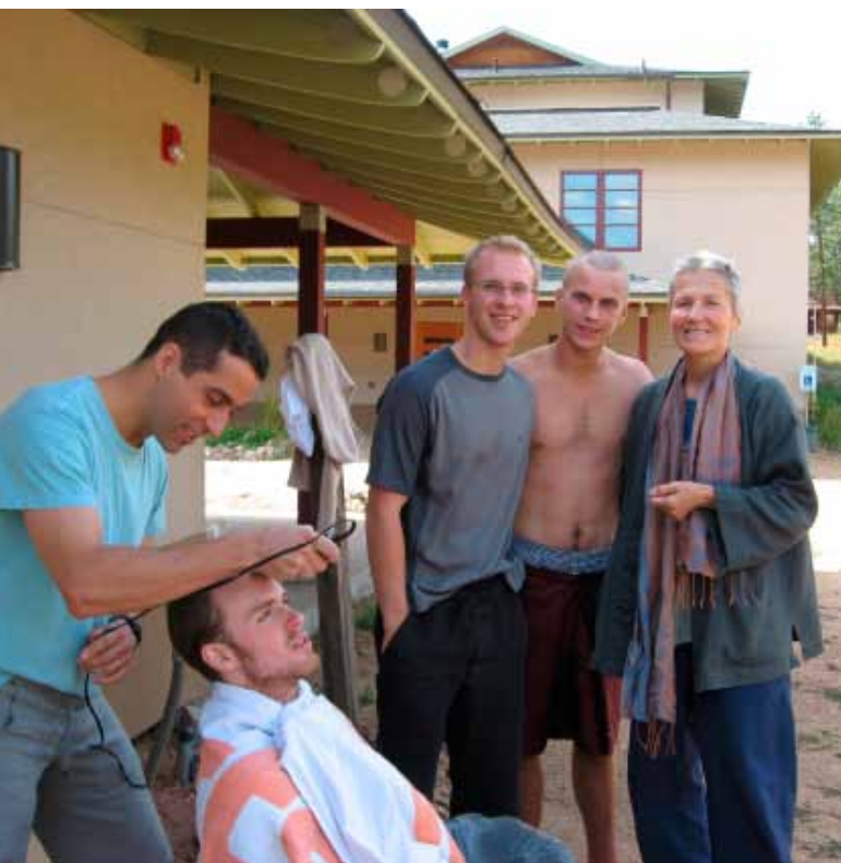
Some of us participants performing a ritual shaving our heads, at the start of retreat

in the face of stress, and improve relationships with other people? Do the changes persist after meditation trainees return from the retreat experience to the cacophony of everyday life in a modern society?” The scientists hypothesized that three months of shamatha training, combined with cultivation of the four qualities of the heart, would result in improved attentional performance (vigilance, selectivity, and meta-cognitive control), as well as greater compassion, security, and ability to better regulate negative emotions.