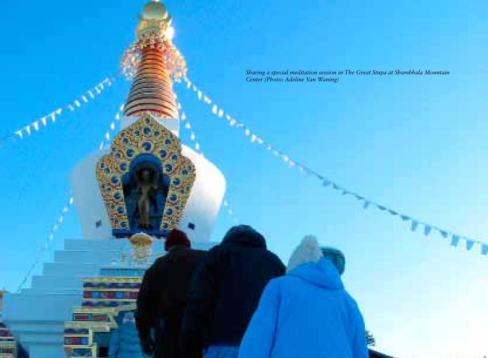
Sharing a special meditation session in The Great Stupa at Shambhala Mountain Center

particularly for Westerners who are conditioned to think of themselves as separate individuals.