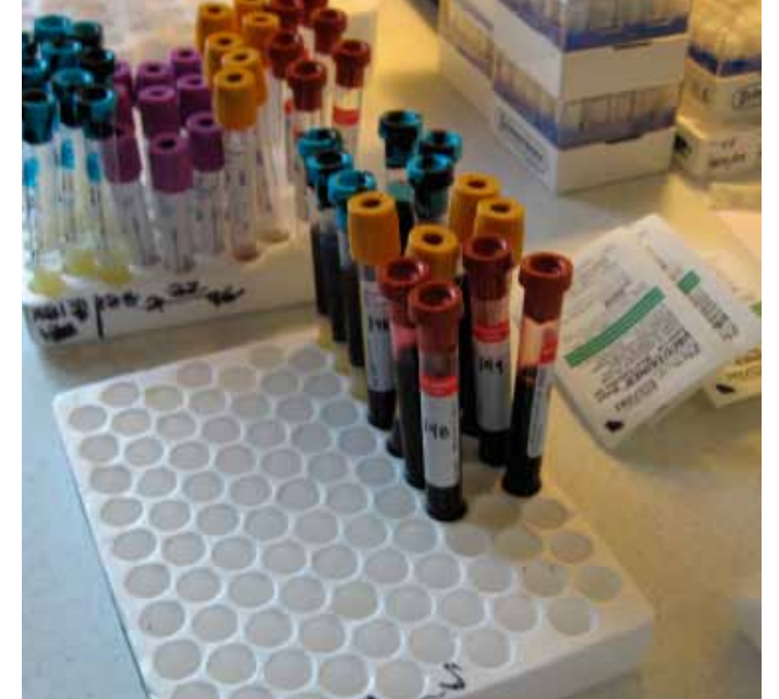
Ten to twenty vials of blood for research assessments were taken, at each measurement period: at the start, halfway and at the end of the three month retreat

The scientists hypothesized that three months of shamatha training, combined with cultivation of the four qualities of the heart, would result in improved attentional performance as well as greater compassion, security, and ability to better regulate negative emotions.