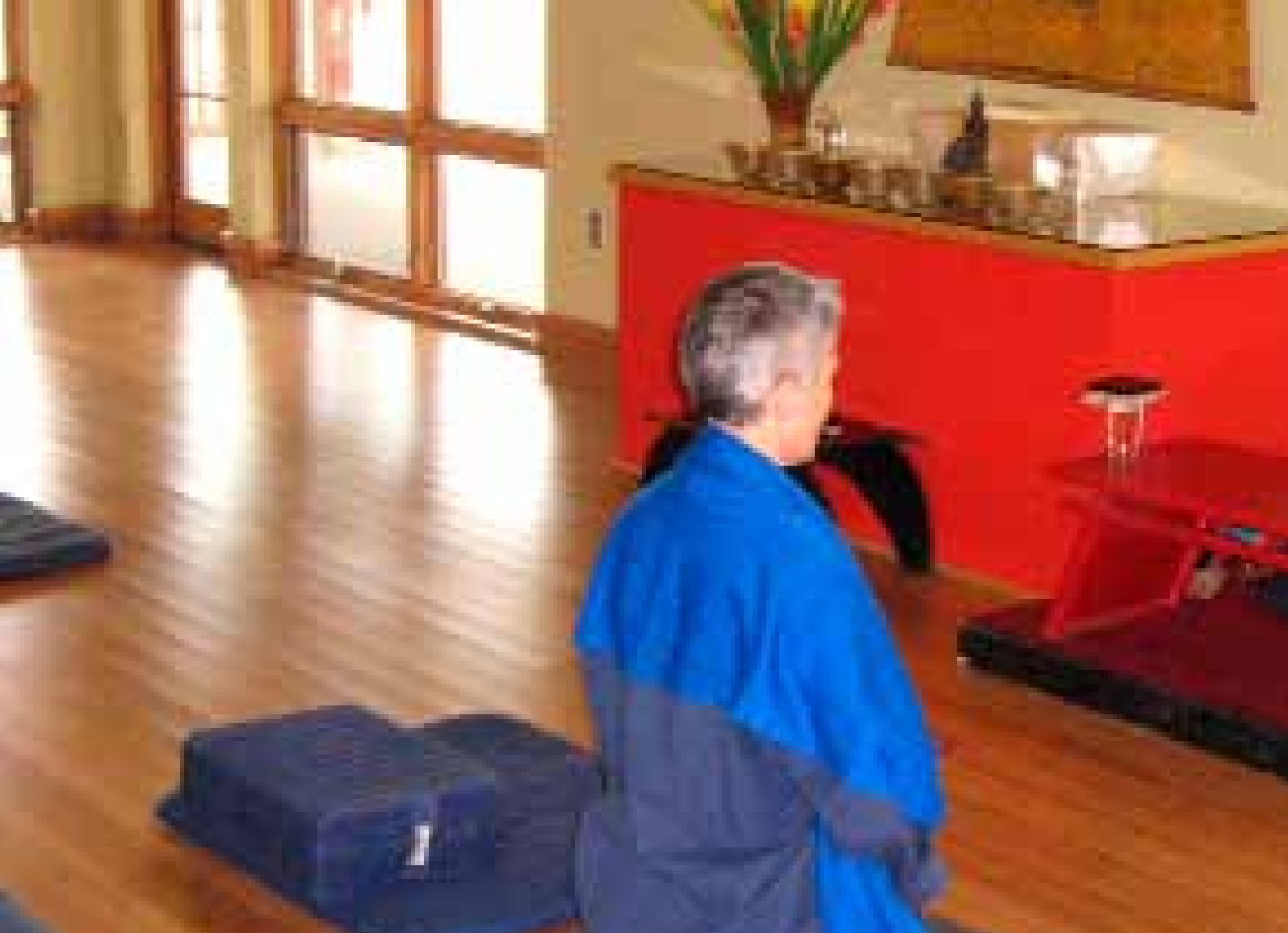
(Opposite) Meditating in the shrine room.

The scientists hypothesized that three months of shamatha training, combined with cultivation of the four qualities of the heart, would result in improved attentional performance as well as greater compassion, security, and ability to better regulate negative emotions.